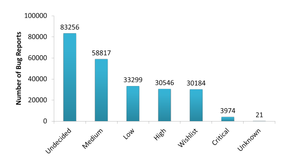
Fig. 1. Number of bug reports with different importance